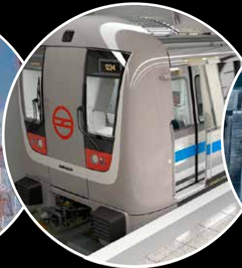
DELHI METRO RAILWAY CORPORATION, NCR