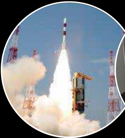
VIKRAM SARABHAI SPACE CENTRE, ISRO TRIVANDRUM