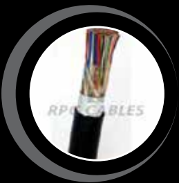
Jelly Filled Copper Cables