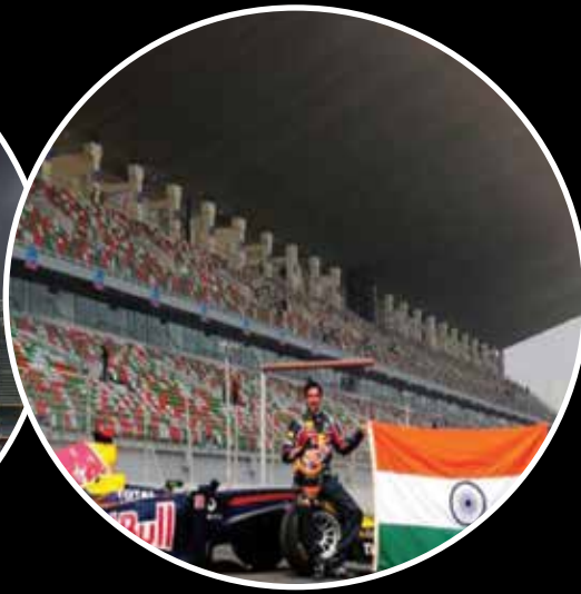
BUDDH INTERNATIONAL F1 CIRCUIT